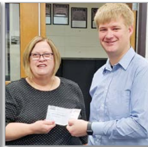
Onalaska High School Band Boosters Donation