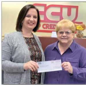
G-E-T Community Food Pantry Donation