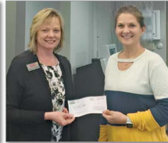
Fall Creek High School Softball Program Donation