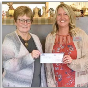
Friends of Melrose Donation