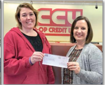
Trempealeau County Humane Society Donation