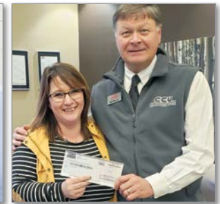
Eleva-Strum Girl Scouts Donation