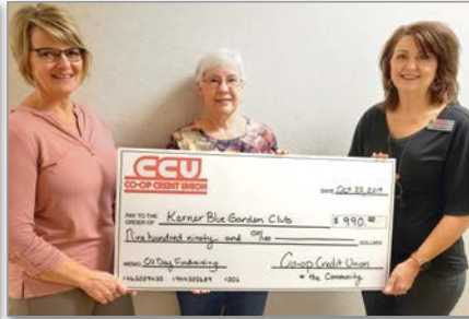
Karner Blue Garden Club Donation