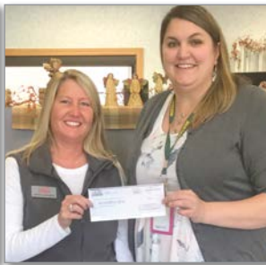
Melrose-Mindoro PTO Donation