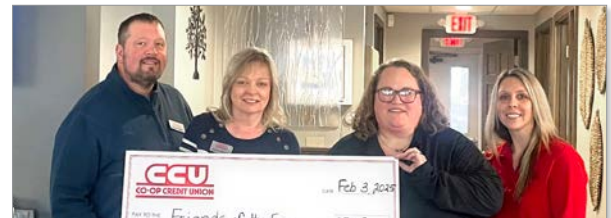
Eau Claire County Fair

This is seen in many ways, including monetary donations, event sponsorships or participation, and volunteer opportunities.