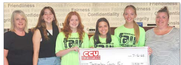
Trempealeau County Fair