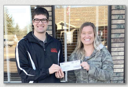
Eleva-Strum Girl Scouts

CCU also sponsored free document collection and destruction on Credit Union Day. The credit union also held a grand prize drawing for a Yeti cooler, Falls Meats gift certificate and grilling supplies package.