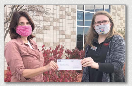
Interfaith Volunteer Caregivers