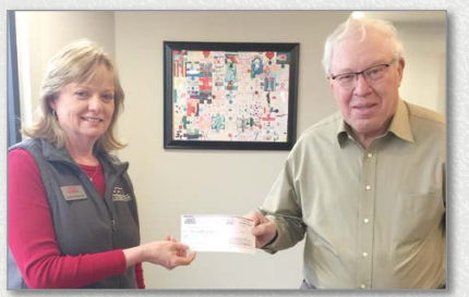
Fall Creek Historical Society