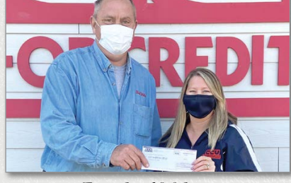
Friends of Melrose