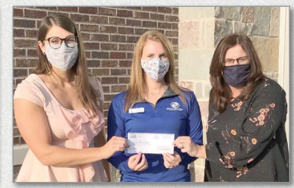
Boys & Girls Clubs of Greater La Crosse