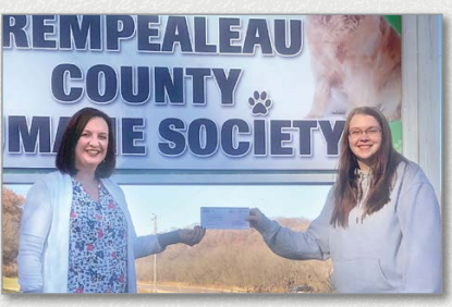
Trempealeau County Humane Society